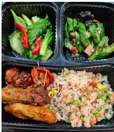
Vegetarian Set Available